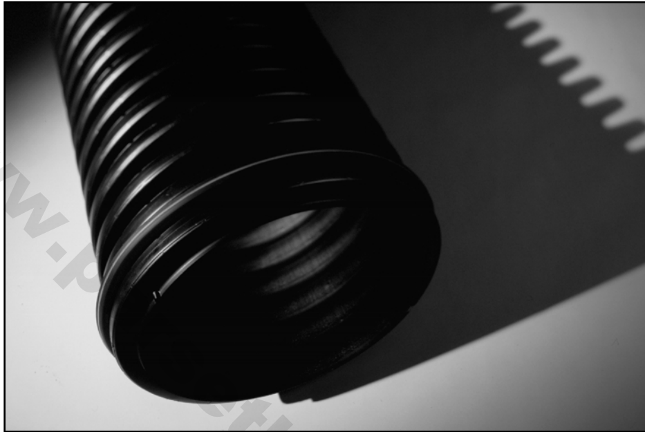
Figure 3-1: Type C HDPE Pipe with Interior and Exterior Corrugations

Typically, Type C pipe with interior and exterior corrugated walls is available in 3-inch through 24-inch diameters. Interior and exterior corrugated pipe in smaller diameters are connected with separate snap-on connections with no gasket. In larger diameters, the connections are made with corrugated bands secured with plastic ties.