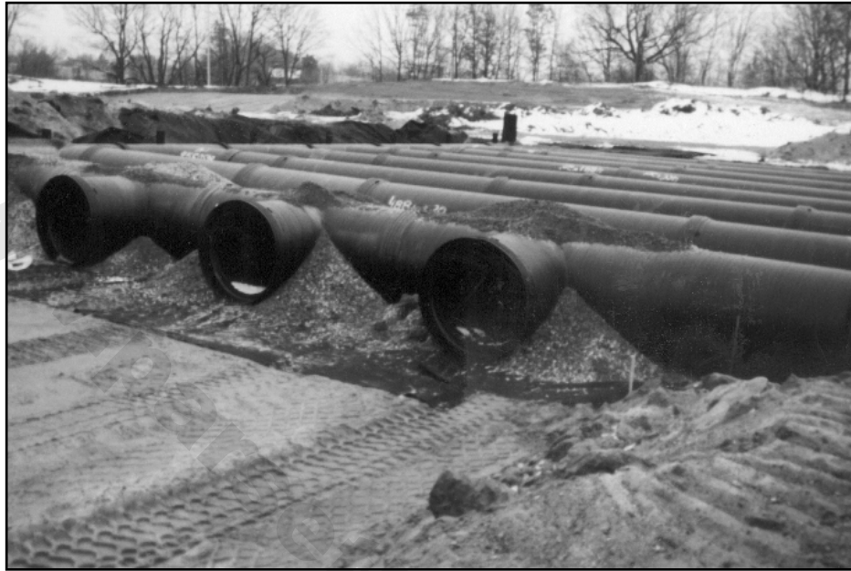
Figure 3-5: On-Site Storm Water Detention Facilities